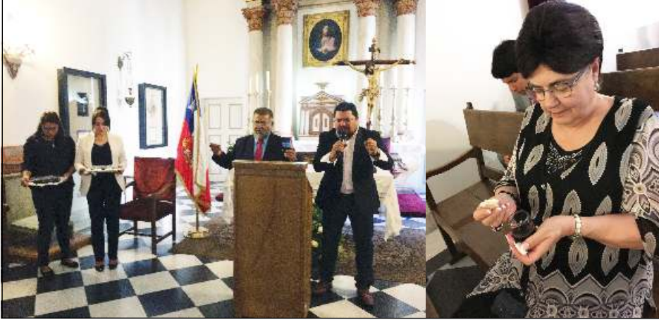
The President's Chapel