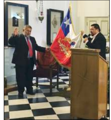
At the President's chapel each week, the flag is held and prayer is given to intercede for the country.

Little did we know in this place of worship, that on April 15, something historic would happen. This was the first time in two hundred and eight years that a Protestant communion was served in this small Roman Catholic chapel now shared with the Evangelicals. It is exciting to be on the forefront of reaching out to government officials with the Gospel.