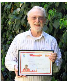
Recognition from the Mayor's Office in Nuñoa for community and spiritual efforts.

We will be going on a mini furlough starting October 7th until January. We hope we can get together during that time as we work on our personal finances. At the present, we don't have a place to stay, but we are trusting the Lord to provide.