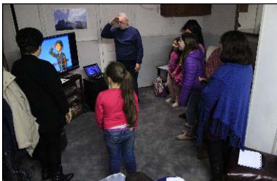
Learning the song, "Soldiers of the Cross", with hand motions.