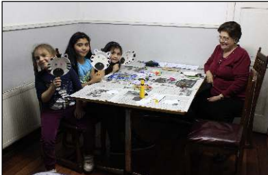
Working on a craft project.