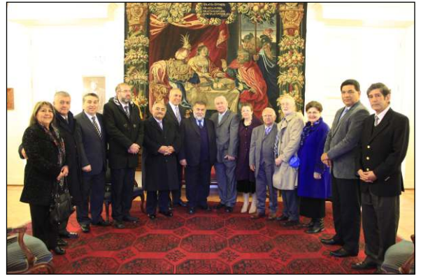
The leadership of the Chilean churches outside the President's office.