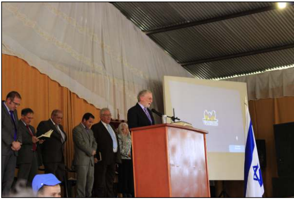
Speaking and praying in a large church 2 hours from Santiago was a great joy.