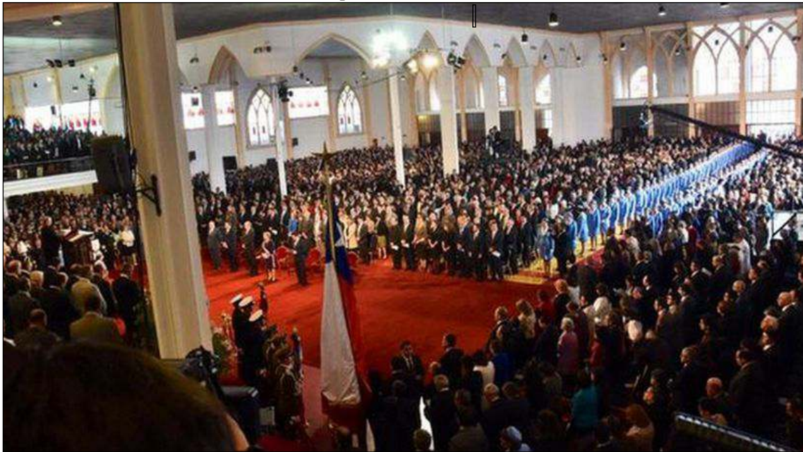
The President along with her cabinet and many from Congress attended the yearly meeting with Chile's evangelical leaders