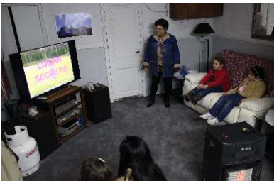
Watching their Bible story.