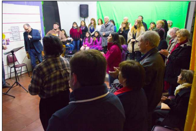
As of Sept. 27th, our little church has now grown during the last few weeks. We now have over 50, but of course, not all are in the picture.