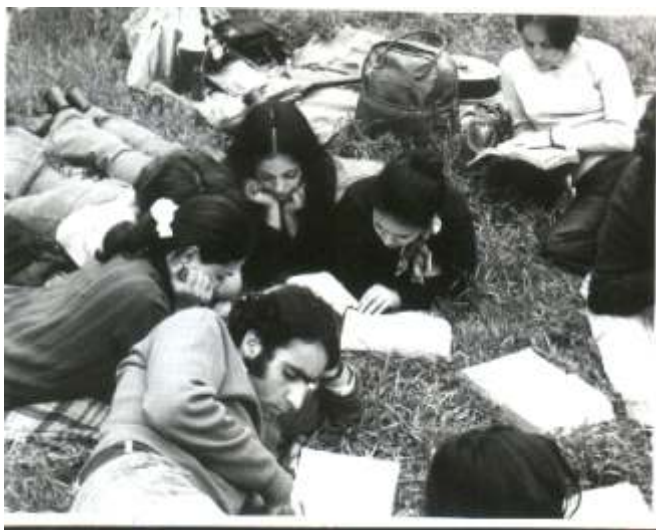
Student camp in 1973